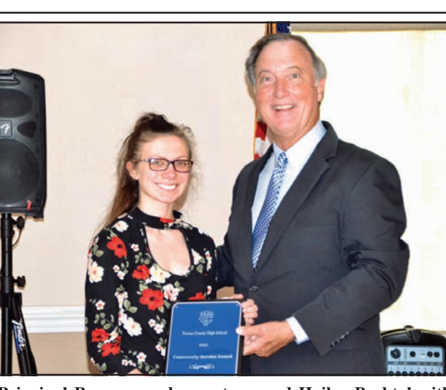
the Community Service Award highlighting the student's