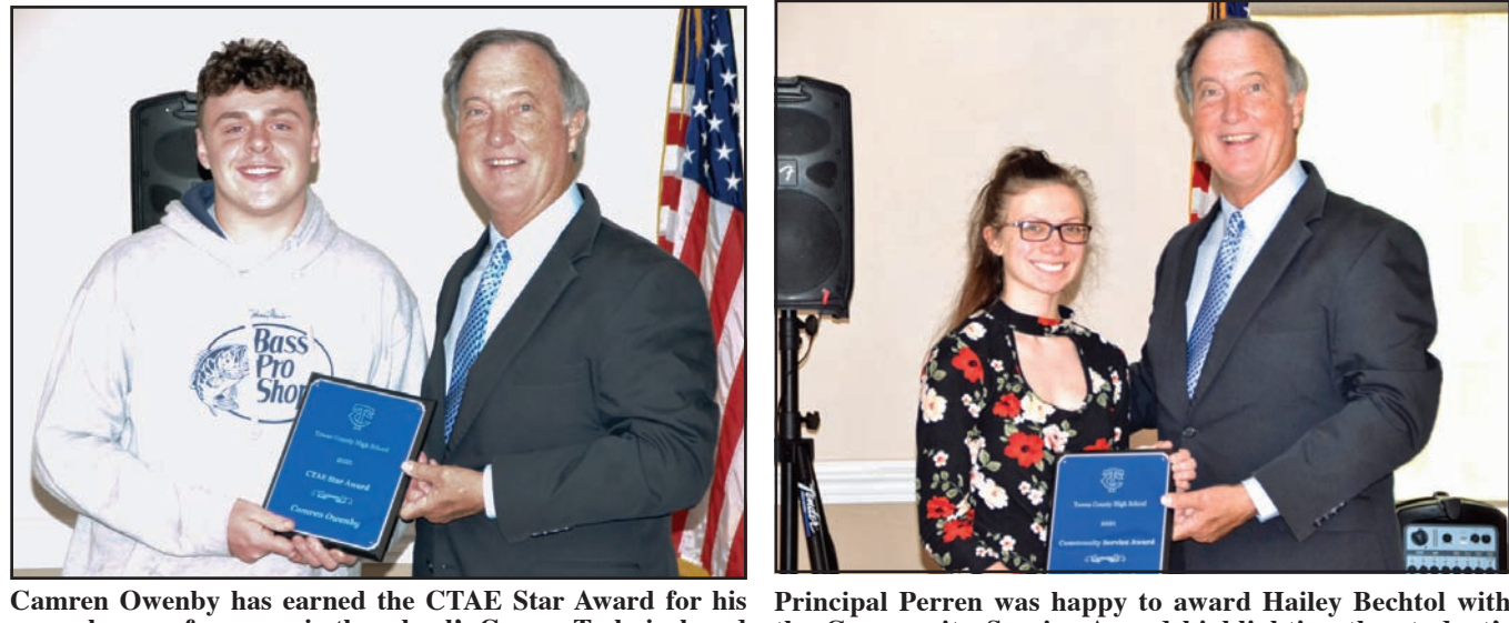
exemplary performance in the school's Career, Technical, and Agricultural Education areas of study. commitment to serving others.

"I encourage each and every person from this moment on to continue to agree that we will continue to pray for our nation, our community, and all the different topics that are going to be prayed for. Don't let it stop there.