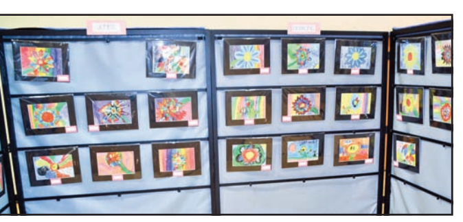
Proceeds from last Thursday's student art sale will go toward resupplying the schools' art classes.

relatively decent year despite the hardships that we had to go under."